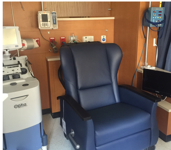
Patient treatment area

You may bring videotapes, writing or reading materials, or small crafts to do during your procedure.